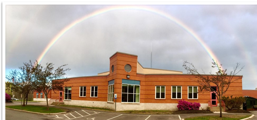
Mast Landing School - Freeport

Thank you for your support! Together, we can help dyslexic students succeed at school and look forward to a bright future!